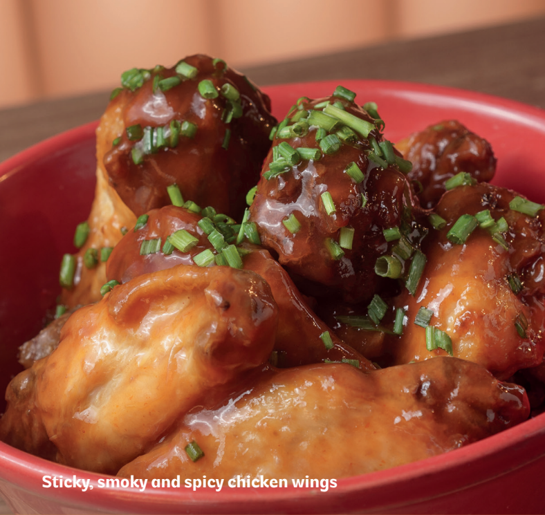
Sticky, smoky and spicy chicken wings