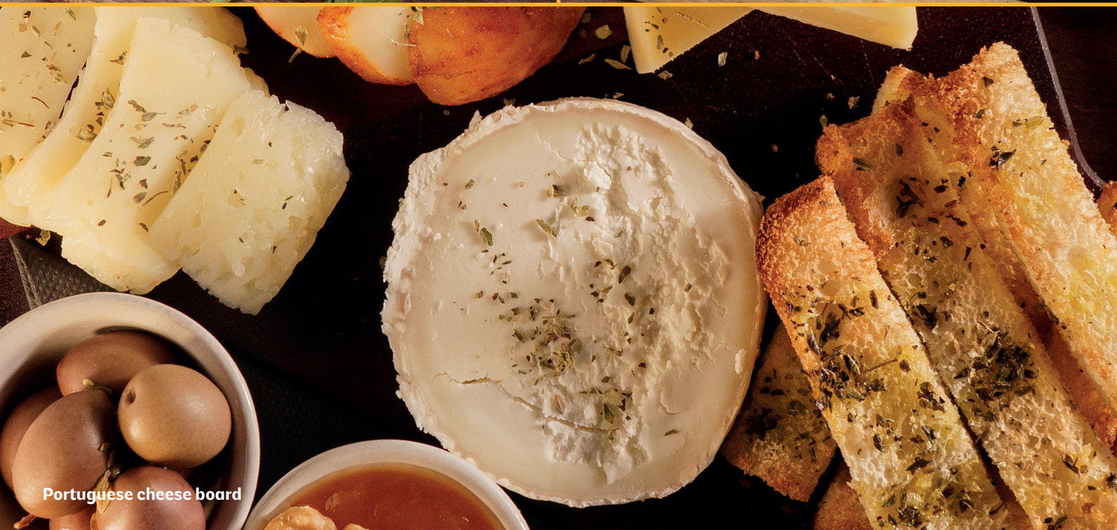
Portuguese cheese board