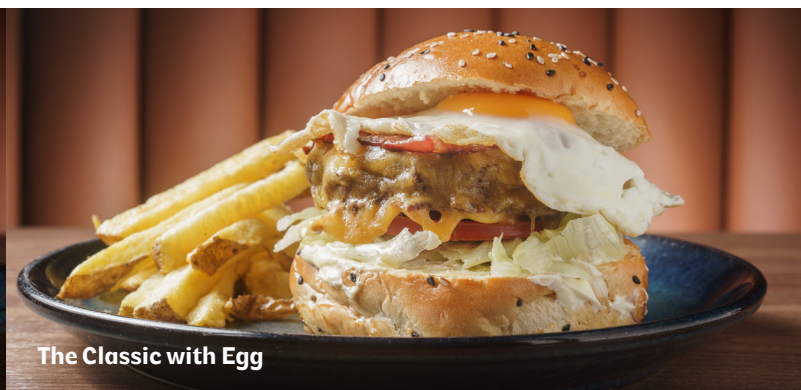
The Classic with Egg