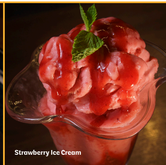
Strawberry Ice Cream