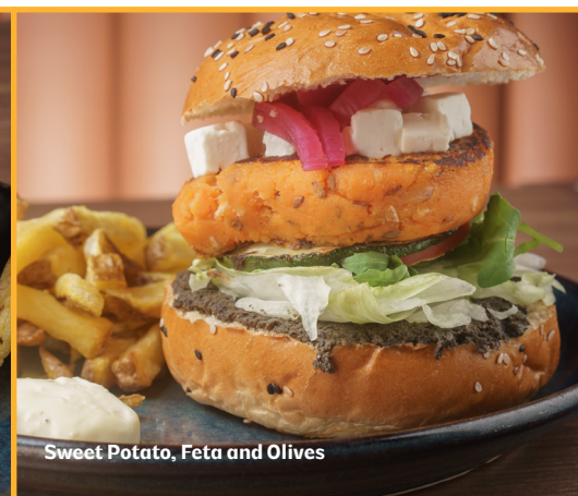
Sweet Potato, Feta and Olives