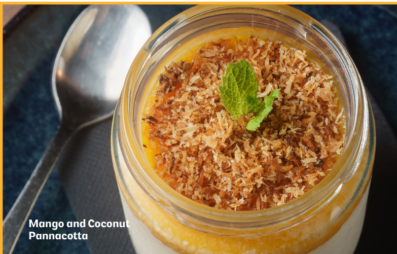
Mango and Coconut Pannacotta