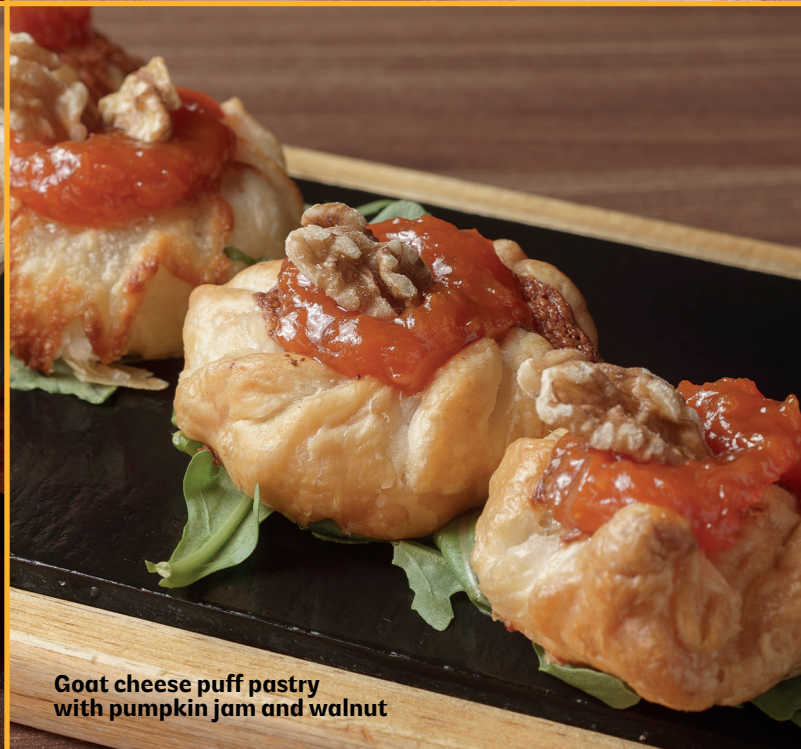
Goat cheese puff pastry with pumpkin jam and walnut