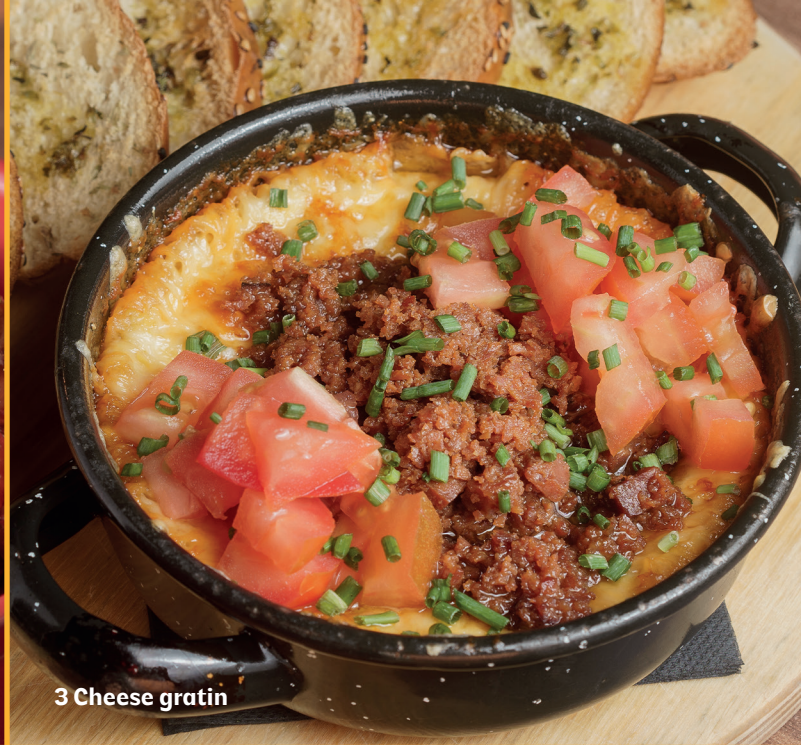
3 Cheese gratin