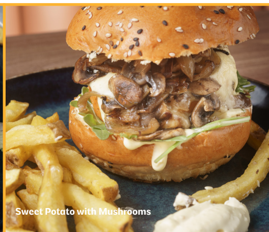
Sweet Potato with Mushrooms