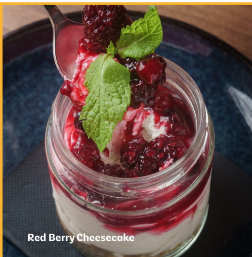
Red Berry Cheesecake