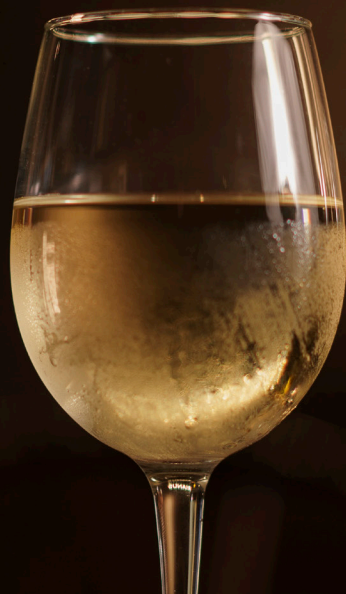
Vinho Verde Bico Amarelo (Esporão)