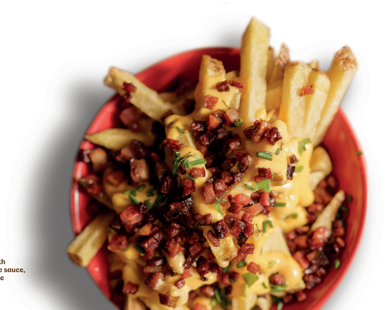
French fries with cheddar cheese sauce, bacon and chive