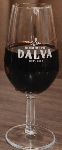
Porto Wine Dalva Tawny