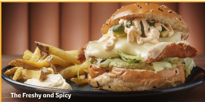
The Freshy and Spicy

Sesame bread, chicken breast marinated in soy and ginger and breaded, bacon, cheddar cheese, lettuce, tomato and barbecue sauce.