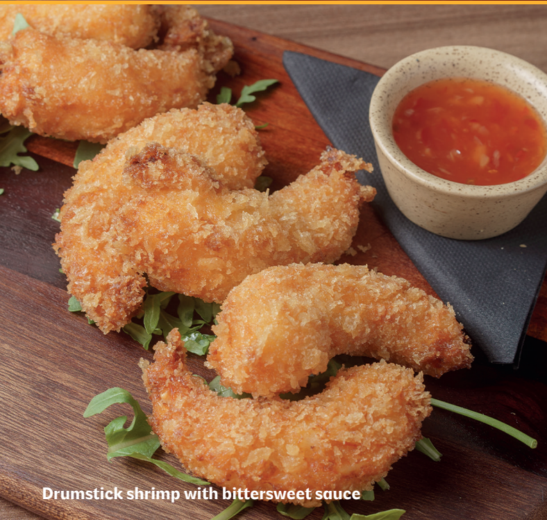
Drumstick shrimp with bittersweet sauce