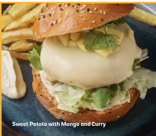
Sweet Potato with Mango and Curry

Sesame bread, sweet potato hamburger, feta cheese, grilled courgette, olives paste, lettuce, arugula, tomatoes and onion pickle.